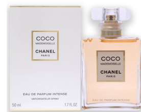
Readers' & People's Choice Women's : CHANEL, Coco Mademoiselle EP Intense