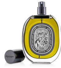
Best New Fragrance Men's: