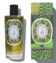
Holiday Fragrance: Diptyque, Sapin de Lumière