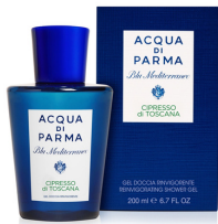
Limited Distribution Men's:

Acqua di Parma, Blu Mediterraneo Ciproso di Toscana