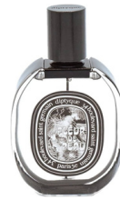
Best New Fragrance Women's: