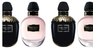
Limited Distribution Women's:

Acqua di Parma, Blu Mediterraneo Ciproso di Toscana