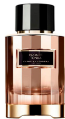
Design & Packaging: