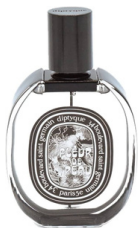
Perfume Extraordinaire: Diptyque, Fleur de Peau.